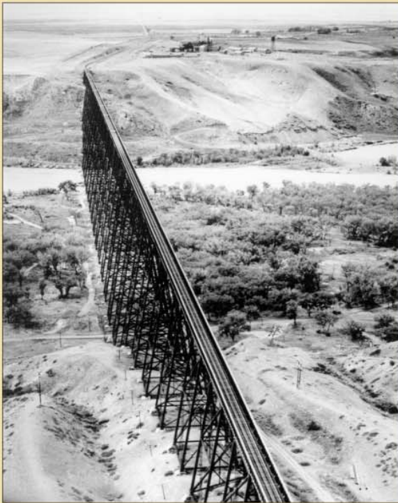
The Galt No. 8 Mine site can be seen at the top of the picture, just right of the C.P.R. High Level Bridge

The buildings of Galt No. 8 Mine, seen here across the river, just right of the C.P.R. viaduct, have been familiar landmarks since 1935. The mine's water tower and tibble stand like exclamation points on the western horizon.