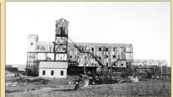
Head frame of Galt No. 8 Mine, 1935